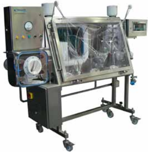
Semi Flexible Isolator

Howorth is pleased to be able to offer an extensive range of transfer systems. Whether our own proprietary designs or 3rd party solutions, we are sure to have a transfer solution to meet with your process, containment and ergonomic needs.